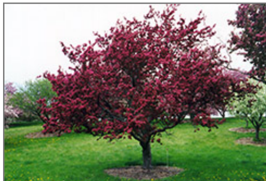
Profusion Flowering Crab in bloom