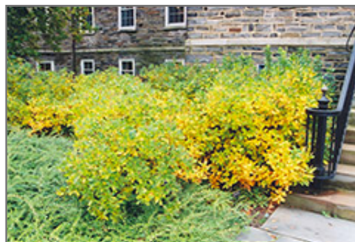
Summersweet in fall

Summersweet is recommended for the following landscape applications;