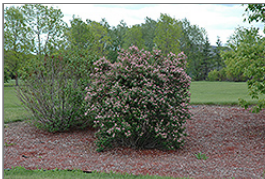
Honeyrose Honeysuckle in bloom