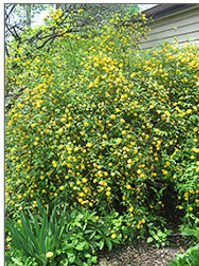
Double Flowered Japanese Kerria