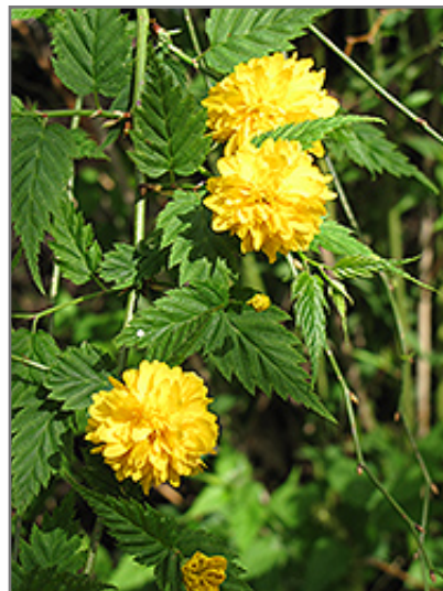
Double Flowered Japanese Kerria flowers