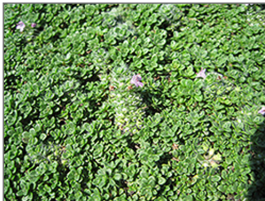
Elfin Creeping Thyme in bloom

This plant will require occasional maintenance and upkeep, and is best cleaned up in early spring before it resumes active growth for the season. Deer don't particularly care for this plant and will usually leave it alone in favor of tastier treats. Gardeners should be aware of the following characteristic(s) that may warrant special consideration;