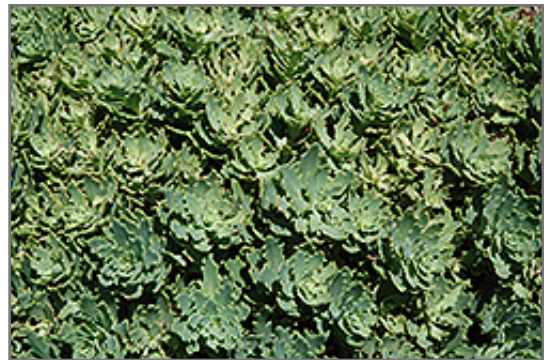
Thundercloud Stonecrop