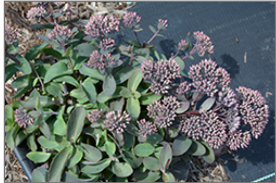
Chocolate Drop Stonecrop flower buds