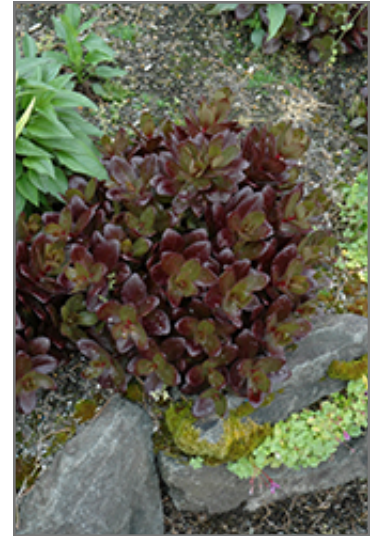
Chocolate Drop Stonecrop

Chocolate Drop Stonecrop is a dense herbaceous perennial with an upright spreading habit of growth. Its relatively coarse texture can be used to stand it apart from other garden plants with finer foliage.