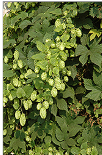
Nugget Ornamental Golden Hops fruit