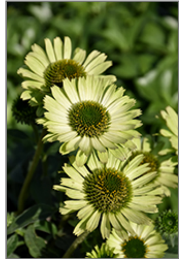
Green Jewel Coneflower flowers

Green Jewel Coneflower is recommended for the following landscape applications;