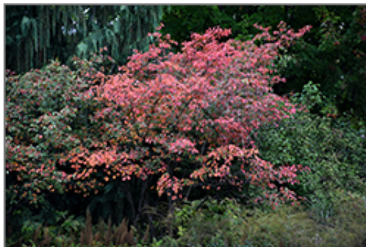
Autumn Brilliance Serviceberry in fall

This tree does best in full sun to partial shade. It prefers to grow in average to moist conditions, and shouldn't be allowed to dry out. It is not particular as to soil type or pH. It is somewhat tolerant of urban pollution. This particular variety is an interspecific hybrid.