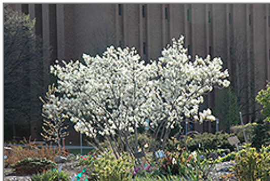
Autumn Brilliance Serviceberry in bloom

Autumn Brilliance Serviceberry is recommended for the following landscape applications;