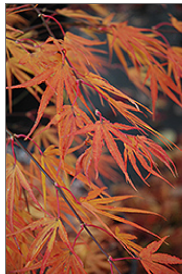
Scolopendrifolium Japanese Maple in fall

Scolopendrifolium Japanese Maple is a fine choice for the yard, but it is also a good selection for planting in outdoor pots and containers. Its large size and upright habit of growth lend it for use as a solitary accent, or in a composition surrounded by smaller plants around the base and those that spill over the edges. Note that when grown in a container, it may not perform exactly as indicated on the tag - this is to be expected. Also note that when growing plants in outdoor containers and baskets, they may require more frequent waterings than they would in the yard or garden. Be aware that in our climate, this plant may be too tender to survive the winter if left outdoors in a container. Contact our store for more information on how to protect it over the winter months.