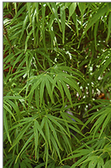
Scolopendrifolium Japanese Maple foliage

Scolopendrifolium Japanese Maple is recommended for the following landscape applications;