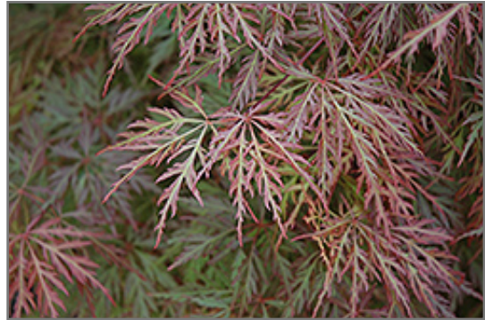
Orangeola Cutleaf Japanese Maple foliage

Orangeola Cutleaf Japanese Maple will grow to be about 8 feet tall at maturity, with a spread of 8 feet. It tends to be a little leggy, with a typical clearance of 2 feet from the ground, and is suitable for planting under power lines. It grows at a slow rate, and under ideal conditions can be expected to live for 60 years or more.