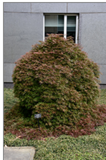
Orangeola Cutleaf Japanese Maple