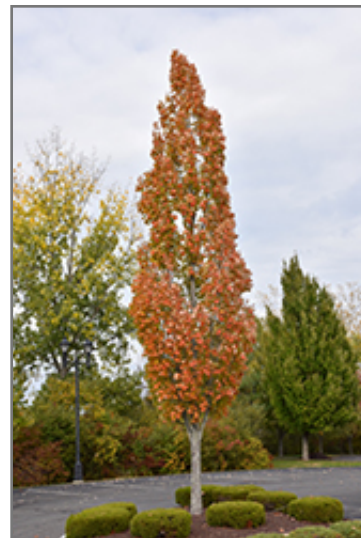
Armstrong Maple in fall

This tree should only be grown in full sunlight. It is quite adaptable, preferring to grow in average to wet conditions, and will even tolerate some standing water. It is not particular as to soil type or pH. It is highly tolerant of urban pollution and will even thrive in inner city environments. This particular variety is an interspecific hybrid.