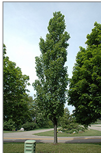
Armstrong Maple