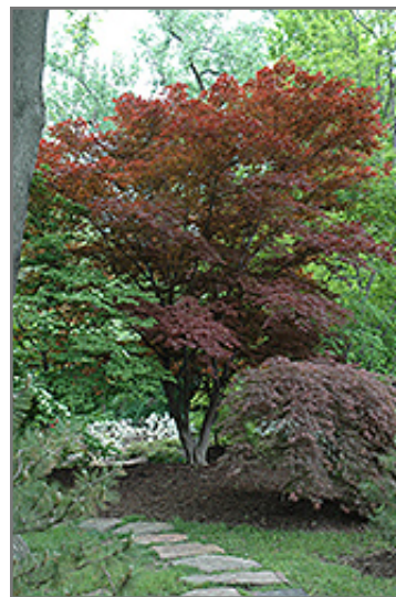
Oshio Beni Japanese Maple