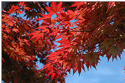
Oshio Beni Japanese Maple foliage

This tree does best in full sun to partial shade. It prefers to grow in average to moist conditions, and shouldn't be allowed to dry out. It is not particular as to soil pH, but grows best in rich soils. It is somewhat tolerant of urban pollution, and will benefit from being planted in a relatively sheltered location. Consider applying a thick mulch around the root zone in winter to protect it in exposed locations or colder microclimates. This is a selected variety of a species not originally from North America.