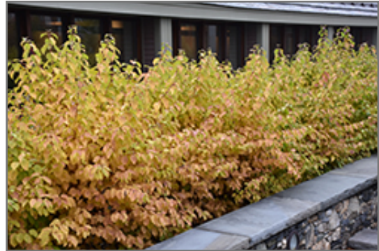
Midwinter Fire Dogwood in fall