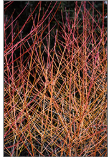
Midwinter Fire Dogwood stems

This shrub does best in full sun to partial shade. It prefers to grow in average to moist conditions, and shouldn't be allowed to dry out. It is not particular as to soil type or pH. It is highly tolerant of urban pollution and will even thrive in inner city environments. This is a selected variety of a species not originally from North America.