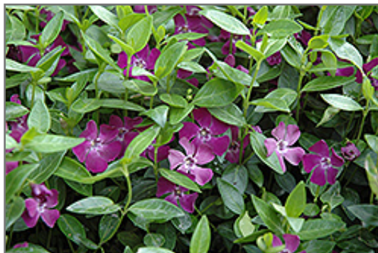
Burgundy Periwinkle flowers