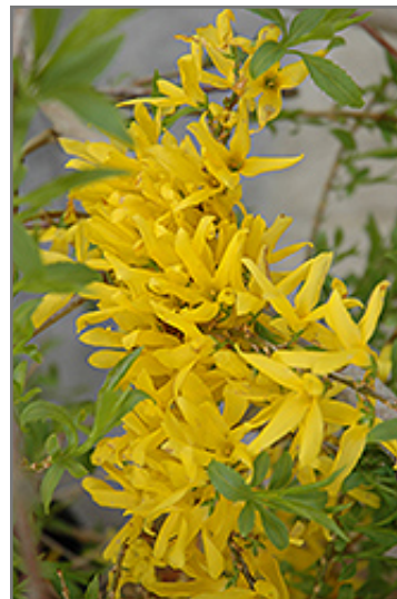
Gold Tide Forsythia flowers

Gold Tide Forsythia is recommended for the following landscape applications;