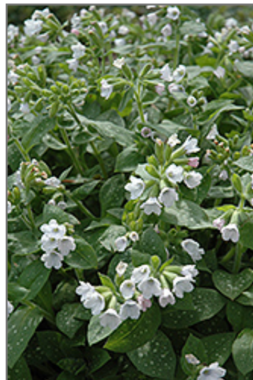
Sissinghurst White Lungwort flowers