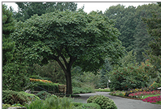
Amur Cork Tree