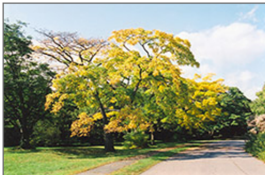
Amur Cork Tree in fall

This tree should only be grown in full sunlight. It is an amazingly adaptable plant, tolerating both dry conditions and even some standing water. It is not particular as to soil type or pH. It is somewhat tolerant of urban pollution. This species is not originally from North America.