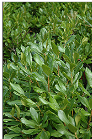
Northern Bayberry foliage