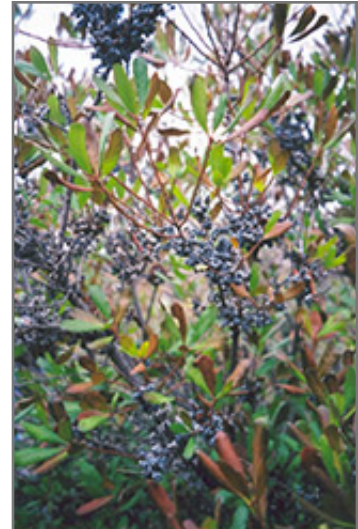
Northern Bayberry fruit

This shrub does best in full sun to partial shade. It does best in average to evenly moist conditions, but will not tolerate standing water. It is very fussy about its soil conditions and must have sandy, acidic soils to ensure success, and is subject to chlorosis (yellowing) of the leaves in alkaline soils, and is able to handle environmental salt. It is highly tolerant of urban pollution and will even thrive in inner city environments. This species is native to parts of North America.