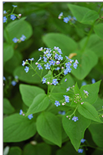
Siberian Bugloss flowers