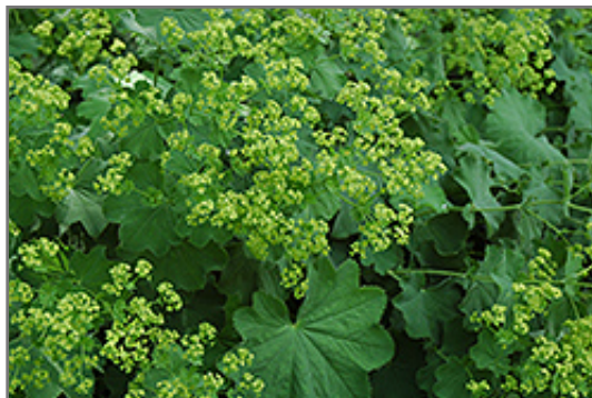
Lady's Mantle flowers

Lady's Mantle will grow to be about 18 inches tall at maturity, with a spread of 18 inches. Its foliage tends to remain dense right to the ground, not requiring facer plants in front. It grows at a medium rate, and under ideal conditions can be expected to live for approximately 10 years.