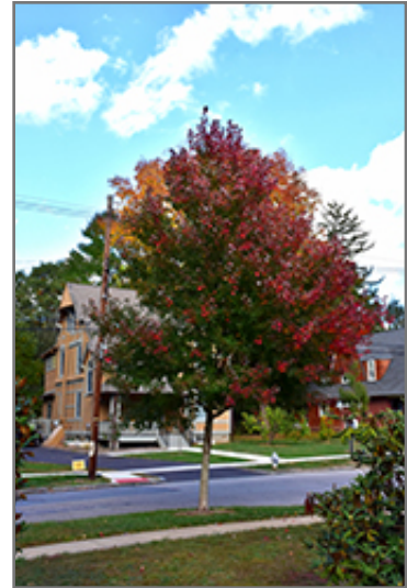
Redpointe Red Maple in fall

This tree should only be grown in full sunlight. It is quite adaptable, preferring to grow in average to wet conditions, and will even tolerate some standing water. It is not particular as to soil type, but has a definite preference for acidic soils, and is subject to chlorosis (yellowing) of the leaves in alkaline soils. It is somewhat tolerant of urban pollution. This is a selection of a native North American species.