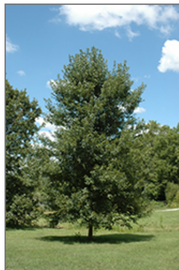
Redpointe Red Maple

Redpointe Red Maple is recommended for the following landscape applications;