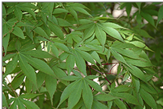
Osakazuki Japanese Maple foliage

This is a relatively low maintenance tree, and should only be pruned in summer after the leaves have fully developed, as it may 'bleed' sap if pruned in late winter or early spring. It has no significant negative characteristics.