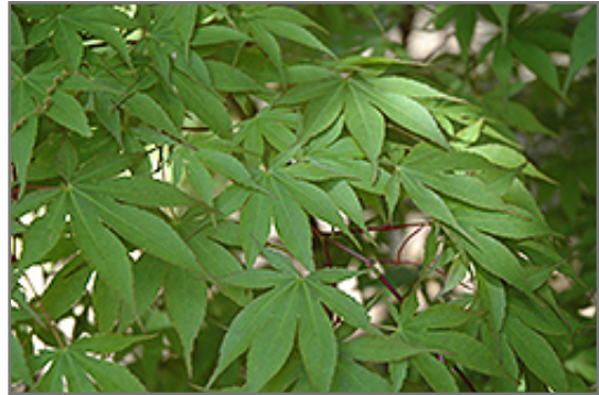
Osakazuki Japanese Maple foliage

This is a relatively low maintenance tree, and should only be pruned in summer after the leaves have fully developed, as it may 'bleed' sap if pruned in late winter or early spring. It has no significant negative characteristics.