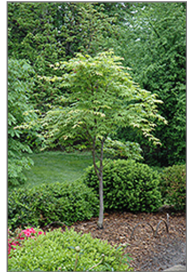
Osakazuki Japanese Maple