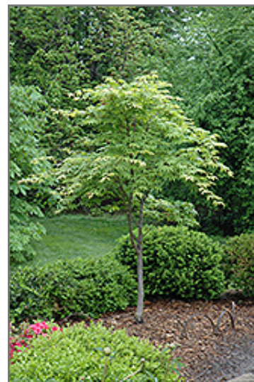
Osakazuki Japanese Maple