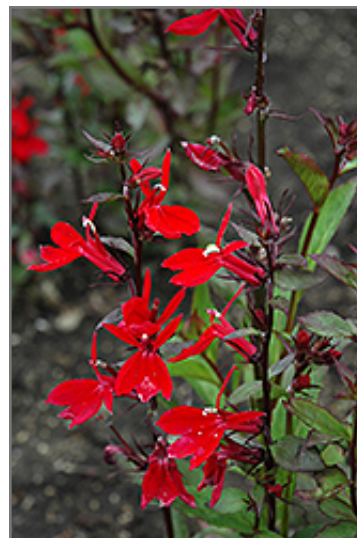
Fan Scarlet Cardinal Flower flowers