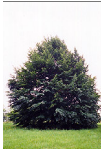
European Beech