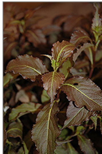
Spilled Wine Weigela foliage

Spilled Wine Weigela makes a fine choice for the outdoor landscape, but it is also well-suited for use in outdoor pots and containers. Because of its height, it is often used as a 'thriller' in the 'spiller-thriller-filler' container combination; plant it near the center of the pot, surrounded by smaller plants and those that spill over the edges. Note that when grown in a container, it may not perform exactly as indicated on the tag - this is to be expected. Also note that when growing plants in outdoor containers and baskets, they may require more frequent waterings than they would in the yard or garden.