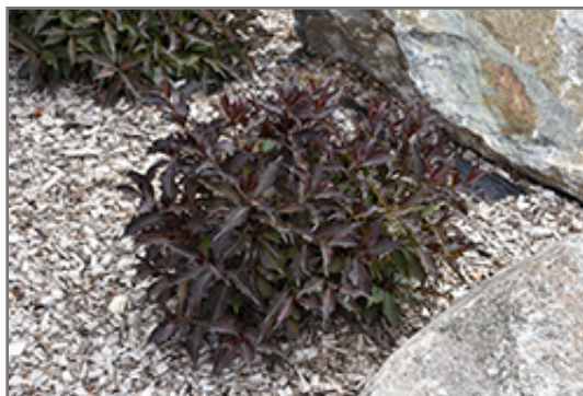
Spilled Wine Weigela