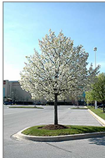
Jack Ornamental Pear in bloom