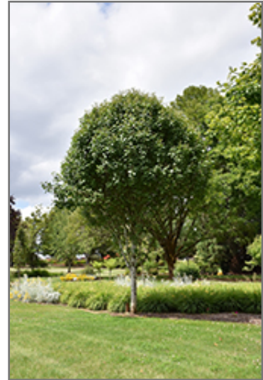
Jack Ornamental Pear

This tree should only be grown in full sunlight. It prefers to grow in average to moist conditions, and shouldn't be allowed to dry out. It is not particular as to soil type or pH. It is highly tolerant of urban pollution and will even thrive in inner city environments. This is a selected variety of a species not originally from North America.