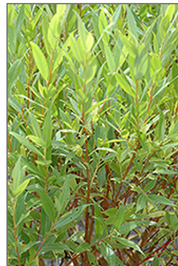
Flame Willow foliage