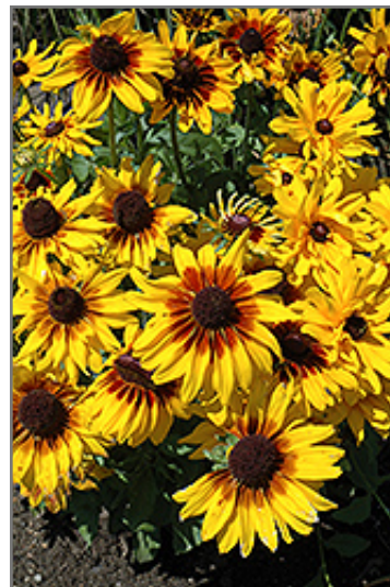
Denver Daisy Coneflower flowers