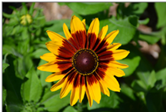
Denver Daisy Coneflower flowers

Denver Daisy Coneflower is an herbaceous perennial with an upright spreading habit of growth. Its medium texture blends into the garden, but can always be balanced by a couple of finer or coarser plants for an effective composition.