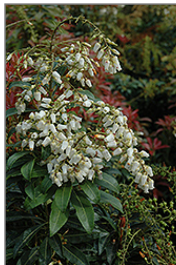
Mountain Fire Japanese Pieris flowers