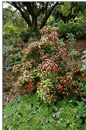
Mountain Fire Japanese Pieris

This shrub does best in full sun to partial shade. It requires an evenly moist well-drained soil for optimal growth, but will die in standing water. It is very fussy about its soil conditions and must have rich, acidic soils to ensure success, and is subject to chlorosis (yellowing) of the leaves in alkaline soils. It is somewhat tolerant of urban pollution, and will benefit from being planted in a relatively sheltered location. Consider applying a thick mulch around the root zone in winter to protect it in exposed locations or colder microclimates. This is a selected variety of a species not originally from North America, and parts of it are known to be toxic to humans and animals, so care should be exercised in planting it around children and pets.