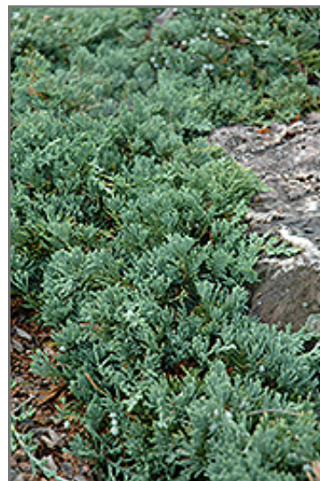
Blue Rug Juniper