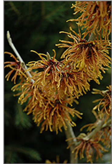
Jelena Witchhazel flowers

Jelena Witchhazel is recommended for the following landscape applications;