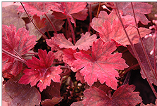
Sweet Tea Foamy Bells foliage

Sweet Tea Foamy Bells is recommended for the following landscape applications;