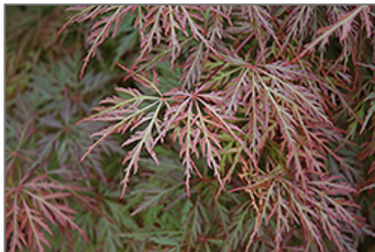
Orangeola Cutleaf Japanese Maple foliage

Orangeola Cutleaf Japanese Maple will grow to be about 8 feet tall at maturity, with a spread of 8 feet. It tends to be a little leggy, with a typical clearance of 2 feet from the ground, and is suitable for planting under power lines. It grows at a slow rate, and under ideal conditions can be expected to live for 60 years or more.