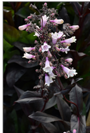
Dark Towers Beard Tongue flowers