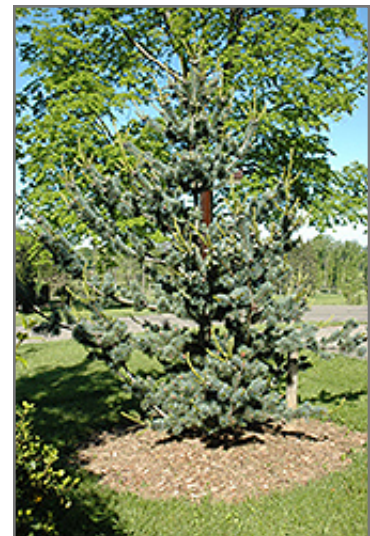
Short-Needled Japanese Blue Pine