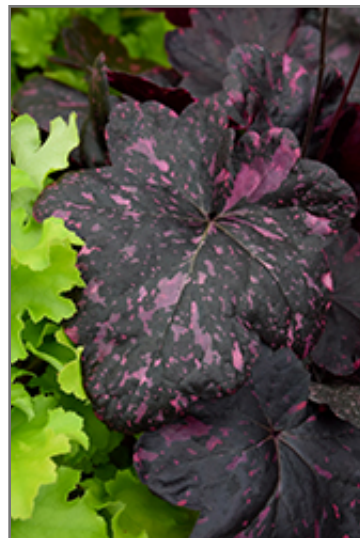
Midnight Rose Coral Bells foliage

Midnight Rose Coral Bells is recommended for the following landscape applications;