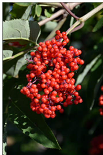
Red-Berried Elder fruit