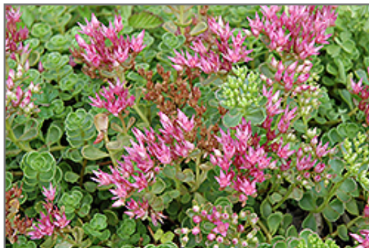
John Creech Stonecrop flowers

John Creech Stonecrop is recommended for the following landscape applications;