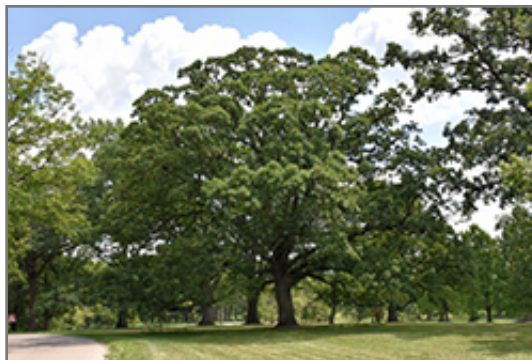
White Oak