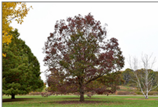
White Oak in fall

White Oak will grow to be about 90 feet tall at maturity, with a spread of 70 feet. It has a high canopy of foliage that sits well above the ground, and should not be planted underneath power lines. As it matures, the lower branches of this tree can be strategically removed to create a high enough canopy to support unobstructed human traffic underneath. It grows at a slow rate, and under ideal conditions can be expected to live to a ripe old age of 300 years or more; think of this as a heritage tree for future generations!