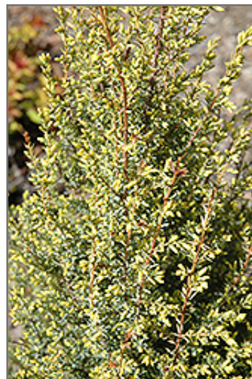
Gold Cone Juniper foliage