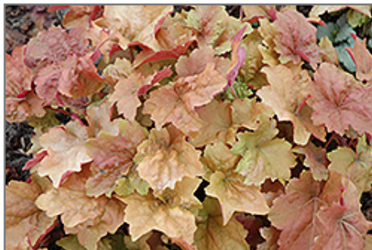
Dolce Creme Brulee Coral Bells foliage