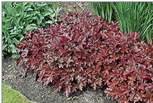
Chocolate Ruffles Coral Bells