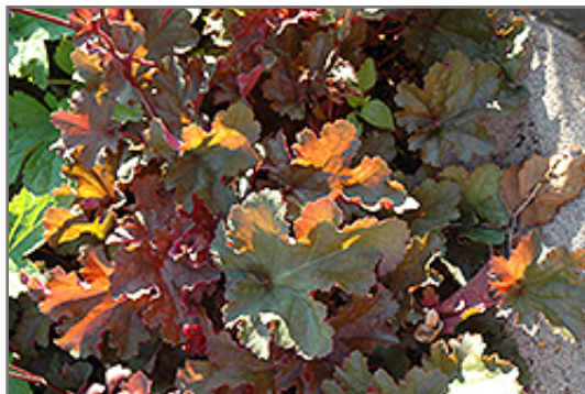
Chocolate Ruffles Coral Bells foliage

Chocolate Ruffles Coral Bells is a fine choice for the garden, but it is also a good selection for planting in outdoor pots and containers. With its upright habit of growth, it is best suited for use as a 'thriller' in the 'spiller-thriller-filler' container combination; plant it near the center of the pot, surrounded by smaller plants and those that spill over the edges. Note that when growing plants in outdoor containers and baskets, they may require more frequent waterings than they would in the yard or garden.