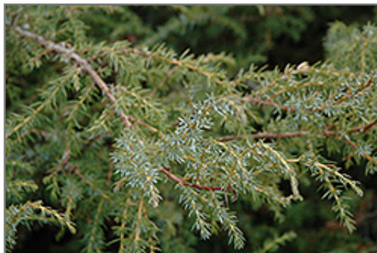
Common Juniper foliage