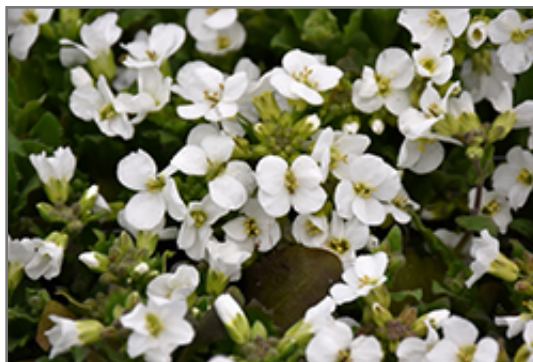
Snowcap Wall Cress flowers