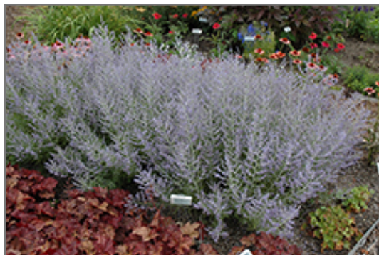
Peek-A-Blue Russian Sage in bloom

Peek-A-Blue Russian Sage is recommended for the following landscape applications;