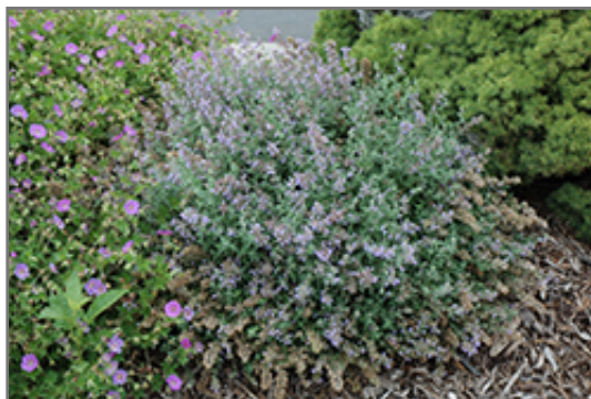
Cat's Meow Catmint in bloom