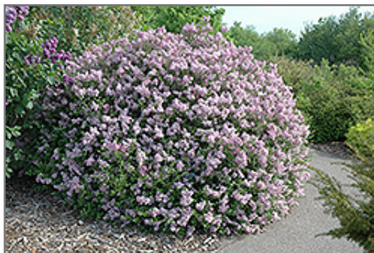
Dwarf Korean Lilac in bloom