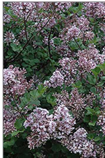
Dwarf Korean Lilac flowers

Dwarf Korean Lilac is recommended for the following landscape applications;