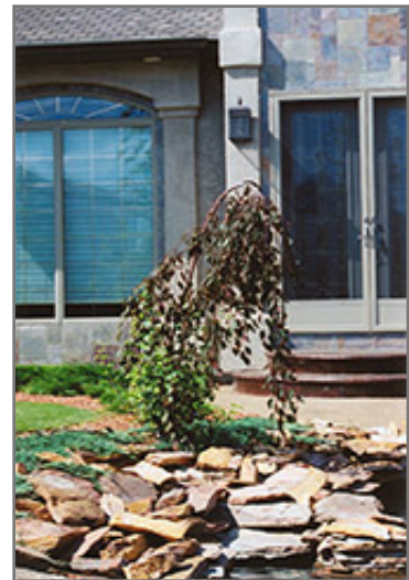
Royal Beauty Flowering Crab